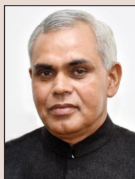
Shri Acharya Devvratji Hon'ble Governor of Gujarat President