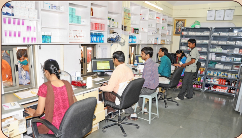
All chemotherapy & other medicines at reasonable price for patients