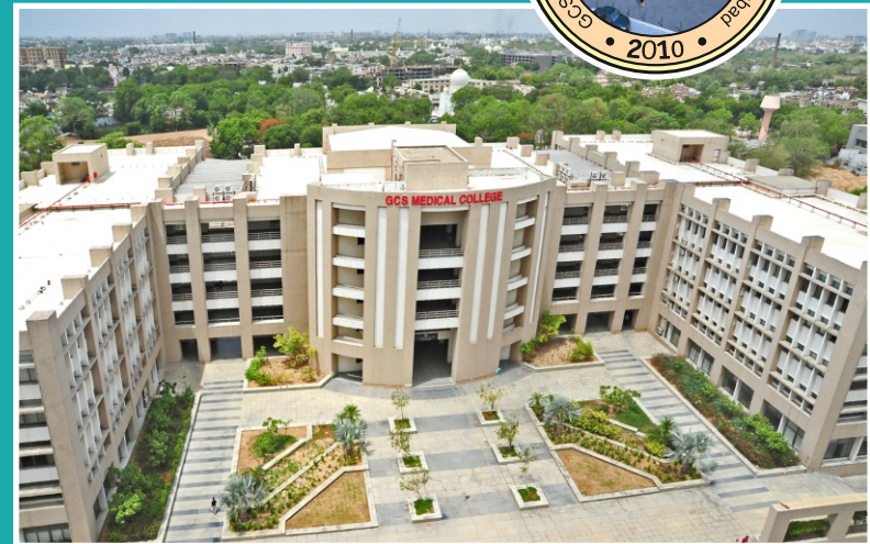
GCS Medical Collage Hospital & Research Center (A Medical Collage & State of art Health Care)