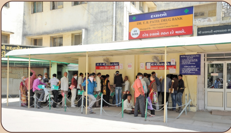
T B Patel Drug Bank premises of GCRI, Civil Hospital Campus