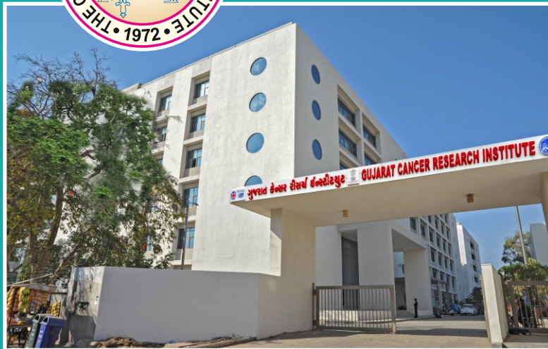
Gujarat Cancer & Research Institute ( A State Institute for Cancer Care, Since 1972)