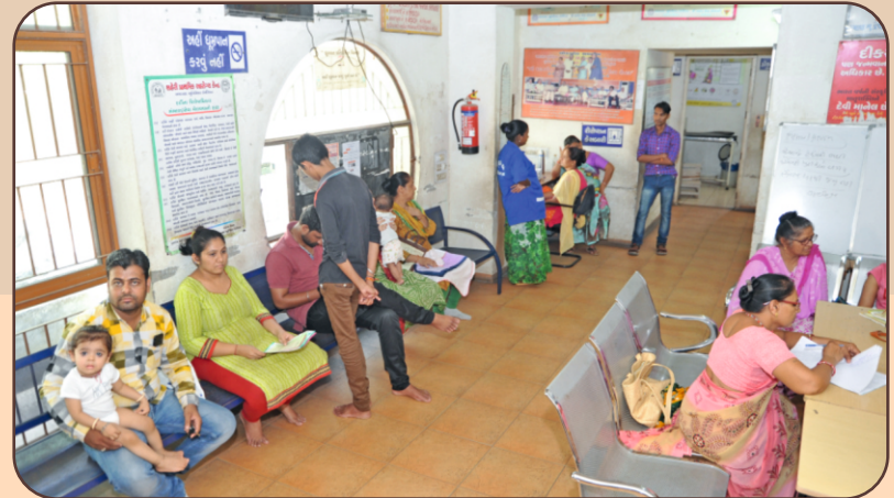
A healthcare set up to serve community at large!!!